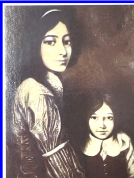
St. Elizabeth Ann Seton 1774 - 1821 Foundress - Sisters of Charity Memorial - 4 January

Saint Elizabeth Ann Seton, whose feast day is January 4, suffered from depression following the death of her husband and subsequent rejection by friends and relatives after she converted to the Catholic Church. Suffering depression so profound that she thought of suicide several times, she founded the nation's parochial school system and became the first American born saint.