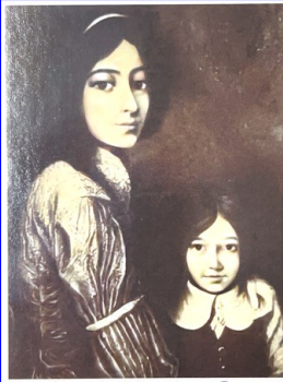
St. Elizabeth Ann Seton 1774 - 1821 Foundress - Sisters of Charity Memorial - 4 January

Saint Elizabeth Ann Seton, whose feast day is January 4, suffered from depression following the death of her husband and subsequent rejection by friends and relatives after she converted to the Catholic Church. Suffering depression so profound that she thought of suicide several times, she founded the nation's parochial school system and became the first American born saint.